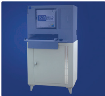
Workstation Base Cabinet

Bases create a secure, space-saving, stable workstation protected against production environmental hazards.