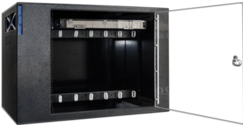
Shown w/ Options 1 Set of Rack Rails Included