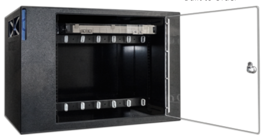
Shown w/ Options 1 Set of Rack Rails Included