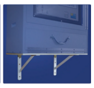
Workstation Base Cabinet