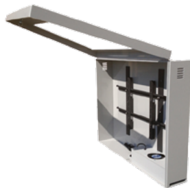
Easy Access Front Door