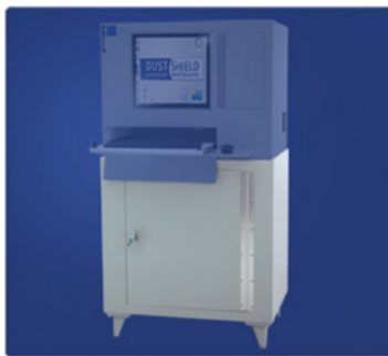
Workstation Base Cabinet

Bases create a secure, space-saving, stable workstation protected against production environmental hazards.