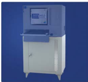
Workstation Base Cabinet

Bases create a secure, space-saving, stable workstation protected against production environmental hazards.