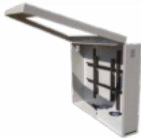
Easy Access Front Door