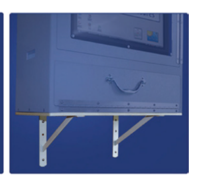
Workstation Base Cabinet