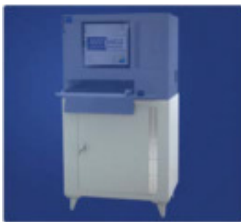
Workstation Base Cabinet

Bases create a secure, space-saving, stable workstation protected against production environmental hazards.