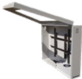
Easy Access Front Door